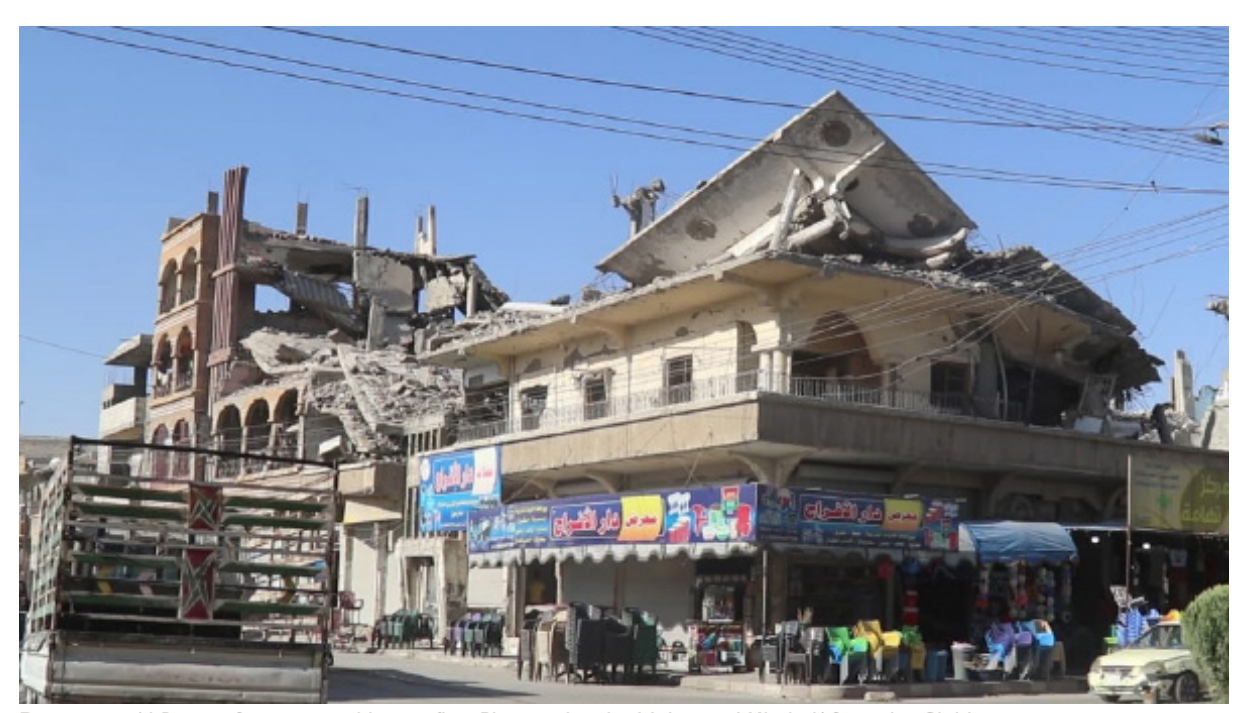
Damage in Al Raqqa, Syria, caused by conflict.

The North East of Syria, as well as other areas of the country, is also experiencing a water crisis, caused by the worst drought in nine years, low water levels in the Euphrates and the deficient functioning of the Alouk water station. Ragga has been particularly affected by the Euphrates water levels and drought owing to its location on the banks of the river. Water prices have increased significantly in the sub-district between January and May 2021, making it more challenging for families with limited resources to afford sufficient clean water, including to ensure they are able to abide by COVID-19 prevention measures in the absence of vaccines. Health facilities have reported increased incidences of water-borne diseases in Al Ragga sub-district.