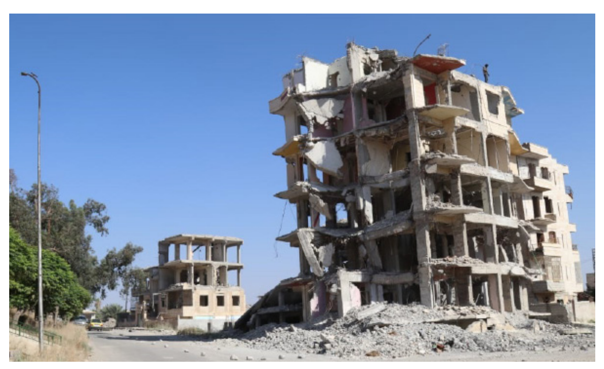
Destroyed buildings in Raqqa city four years after the city was recaptured from ISIS. Photo taken on 1 June 2021/ Save the Children

While the city may not have witnessed active hostilities in four years, security concerns persist. People we spoke to still report that the widespread destruction, piles of rubble and collapsed buildings make them feel unsafe. Recreational activities for children are very limited, and parents worry about rubble across the city including the risk of explosive remnants of war in various neighbourhoods of the city.